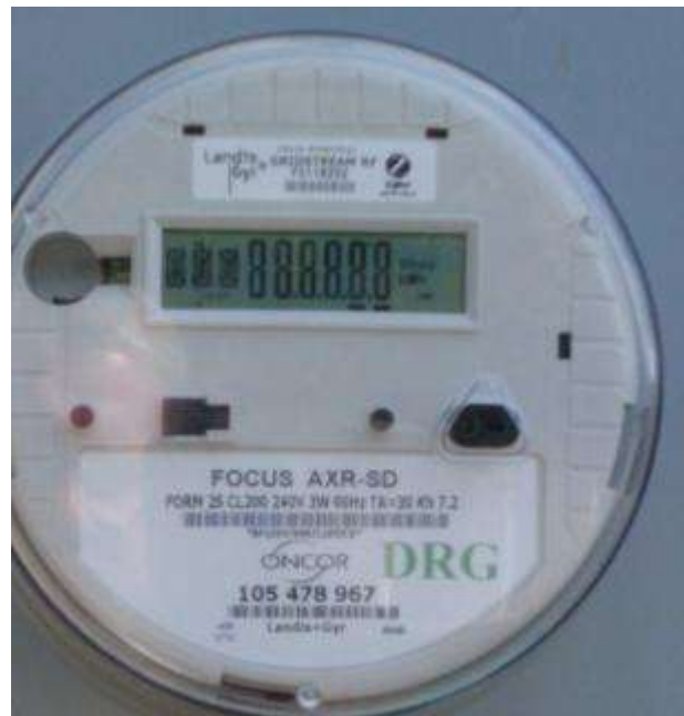
5. Closeup – Main service meter

(meter make, model, kWh-out readout if possible, and meter # visible)