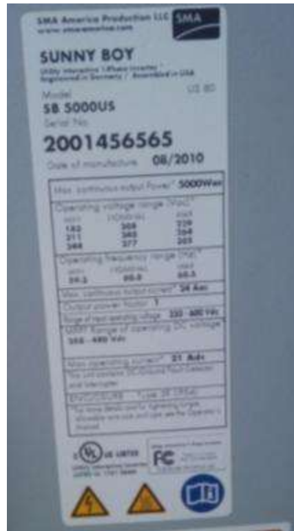
4. Closeup – Inverter specs label