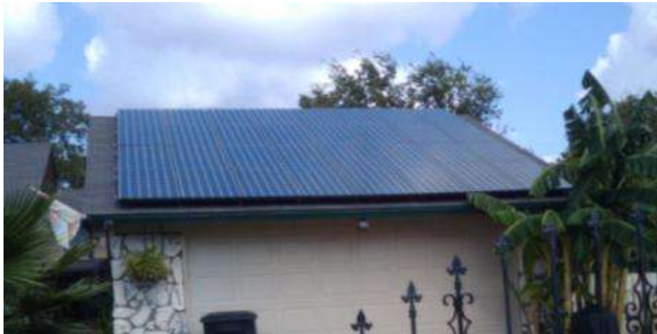
1. Overview – PV array (all modules are visible, countable)